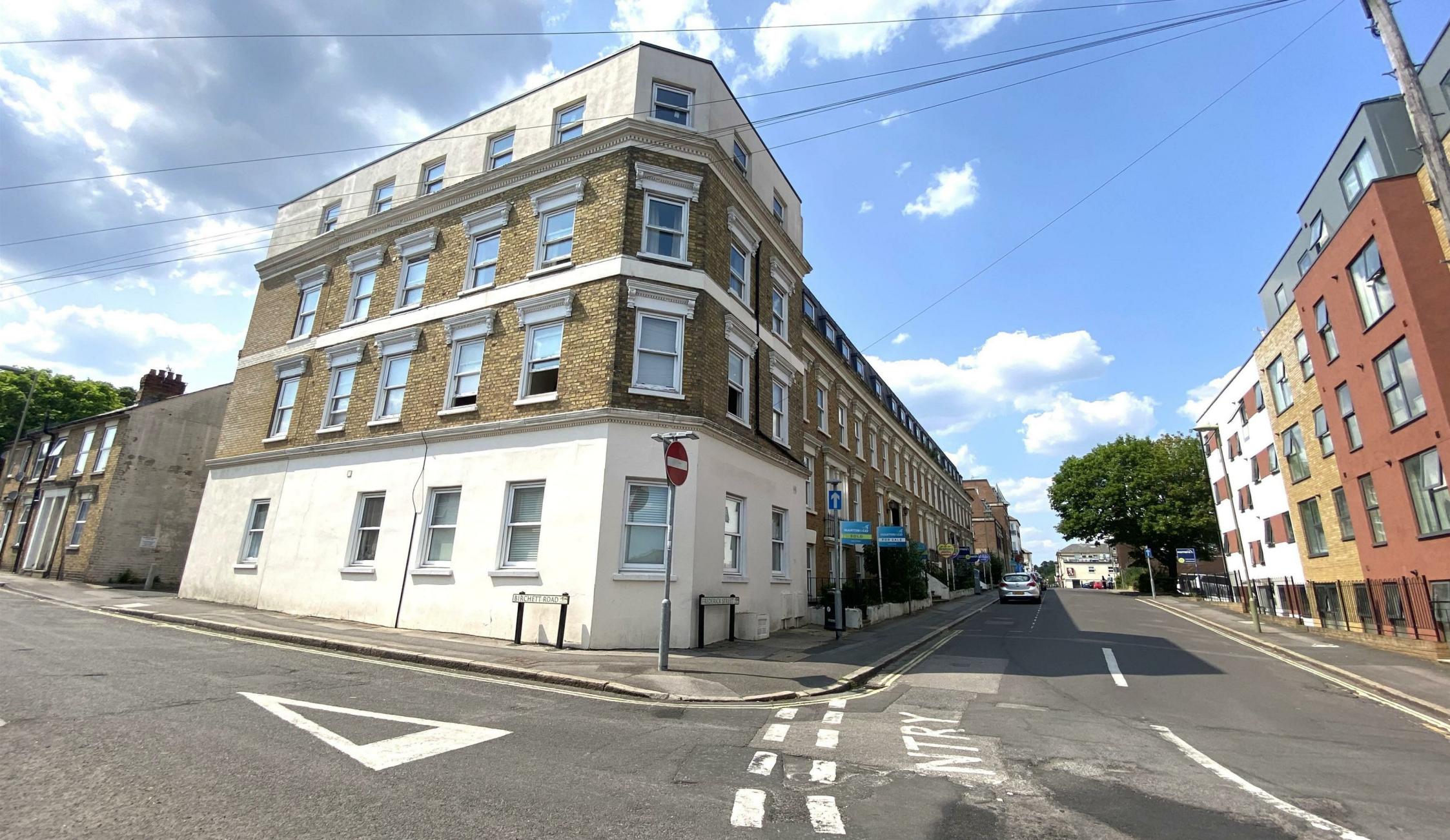
7 Birchett House Birchett Road, Aldershot